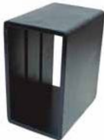
Parts needed for a complete solution

SBTB-kehukset, pohjamaalattu teräs » Рама SBTB, окрашенная, стальная » SBTB-ramar, lackerat konstruktionsstål » Telaio SBTB, in acciaio con prima mano d'antiruggine